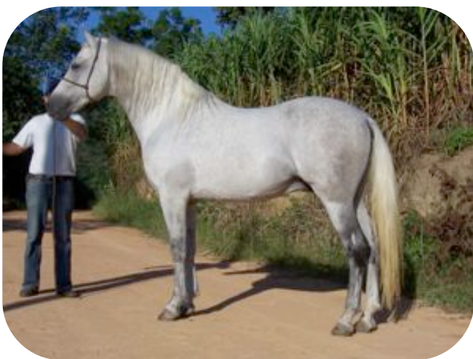
Licor Lapidade, 4 Seasons Marchador Stallion, imported in 2008.

The USMMA Registry recognizes and promotes the new breeding technologies and so, two historic births were just recorded in 2008.