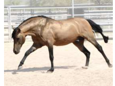
La Paz Jivago - first frozen semen foal born in 2008, first frozen embryo using frozen semen in 2008. Both times the mare was Bossa Nova de Miami

Frozen Semen: Summerwind Marchadors At Stud: Sunset Marchadors