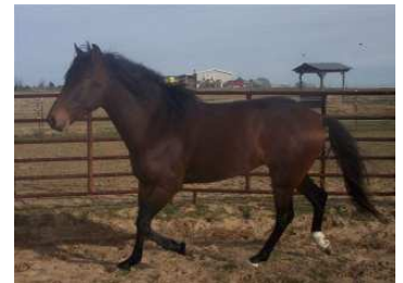
Marchwind Damon At Stud: Marchwind Marchadors

Frozen Semen: Summerwind Marchadors At Stud: Sunset Marchadors