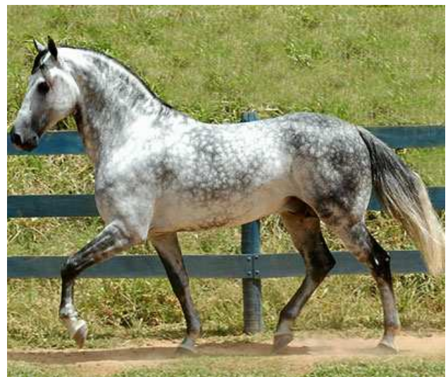
Jupiter Quitumba - Possible frozen semen donor from Brazil