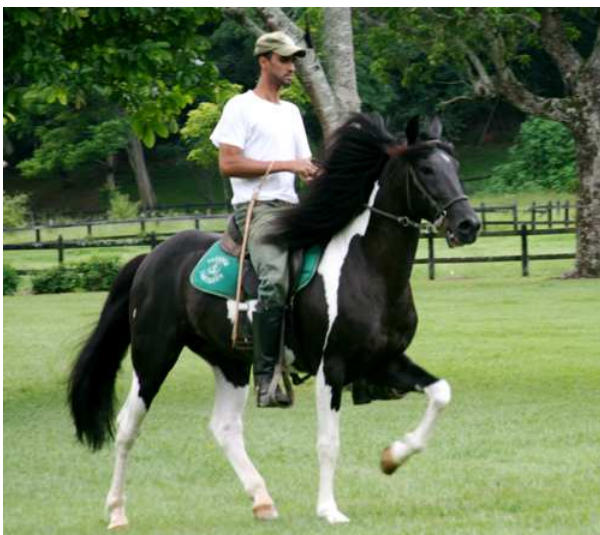
Misterio do Pumutuju - Possible frozen semen donor from Brazil