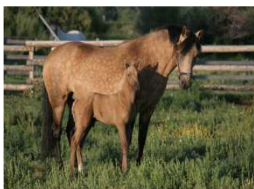
Buckskin: Shown is Vicosa de Itajoana

Buckskins and Palominos each carry one dilution gene which should be considered when breeding.