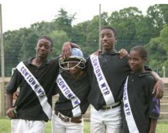
Work to Ride made history with the first African-American Polo team in the nation. In addition one of their players was voted in 2005 as the #1 National All Star player.

We all know that horses can change lives; those of us who own horses can attest to that fact without reservation. But in Philadelphia, PA the Work to Ride program is proving it.