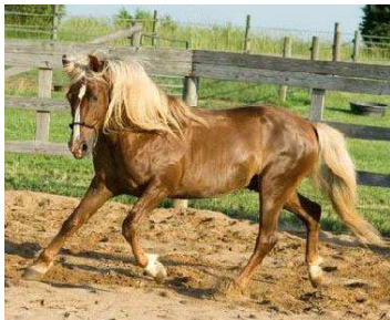
Palomino: Shown is Bom Dia do Premier