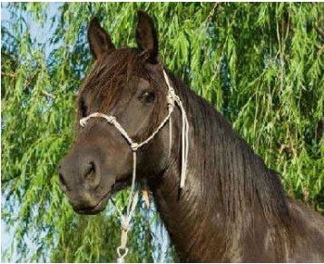
Cetine do Premier (in foal to Bom Dia do Premier)