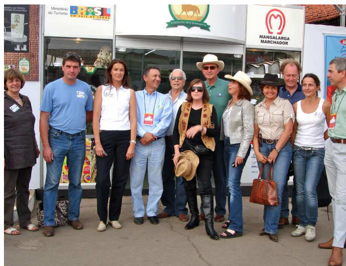
ABCCMM, USMMA and EAMMA Members at Belo Horizonte