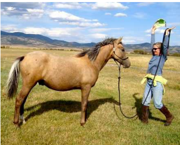
Caetano de Lazy T: Now Buckskin

In Brazil the color of a foal is noted at birth.