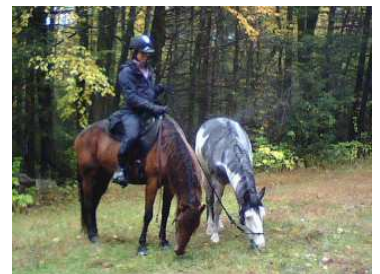
Azenha de Maripa gets a lesson in ponying another horse. These two horses are not buddies, but have now traveled together for nearly 150 miles on conditioning rides like this without issue