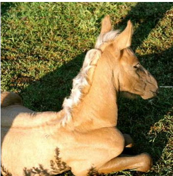
Caetano de Lazy T: Born Palomino