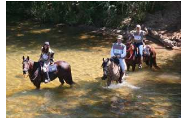
Competitors in a Brazilian trail competition spend a moment cooling their Marchadors.